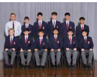
Junior Football Conference 3 Champions