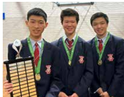
Junior Chess Conference 3 Champions