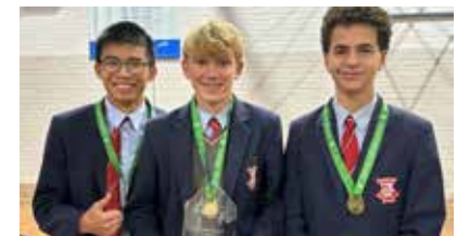
Intermediate Chess 3 Conference 3 Champions