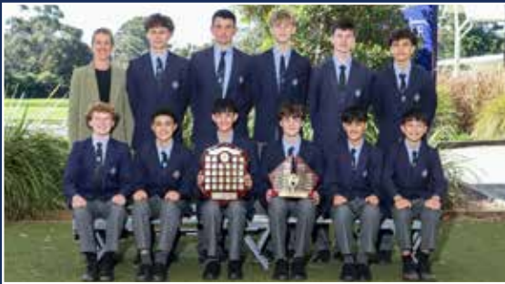
JUNIOR BOYS BASKETBALL: CONFERENCE 3, SCS AND NSWCC CHAMPIONS