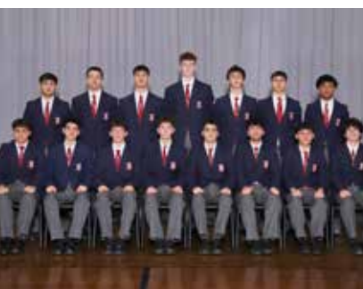
Senior Football Conference 3 Champions