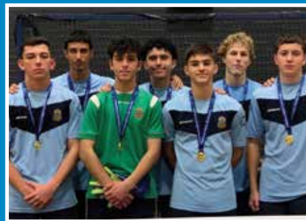
U16 FNSW Futsal Regional Championship Winners