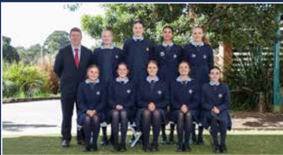
INTERMEDIATE GIRLS BASKETBALL: CONFERENCE 3 CHAMPIONS