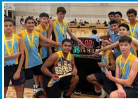
Junior Basketball SCS Conference Champions