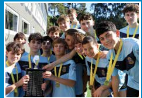
Junior Football SCS Conference Champions

Register Now for our 2025 Open Day • (02) 8585 1744 • cbhslewisham.nsw.edu.au