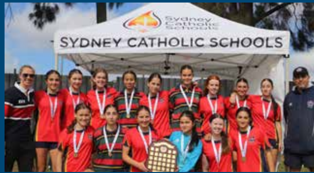
Intermediate Girls Football

Marist Catholic College Penshurst has continued a proud sporting tradition with outstanding results in the Sydney Catholic Schools (SCS) sports competitions during 2024. We are proud of all our students and coaches for their hard work, team spirit and excellent results throughout the competitions. The College boasts two Sydney Catholic Schools champion teams - Junior Girls Football and Intermediate Girls Football. A further four teams won their Conference 3 championships: Junior Girls Rugby 7's, Junior Boys Rugby 7's, Intermediate Boys Rugby 7's and 7-A-Side Soccer. These are outstanding performances across a range of sports. Well done to all involved in our sports program - a team of sports stars.