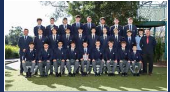
OPENS BOYS RUGBY LEAGUE B GRADE: SCS CHAMPIONS