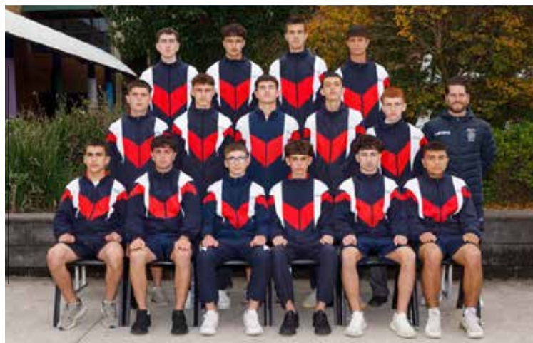
Intermediate A Boys Football Team