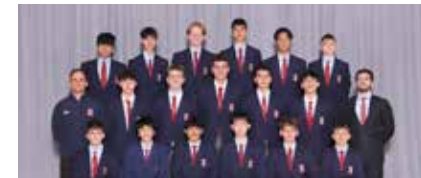
Tennis Squad Junior Tennis - Conference 3 Champions Intermediate Tennis - Conference 3 and Sydney Catholic Schools Champions Senior Tennis - Conference 3 Champions