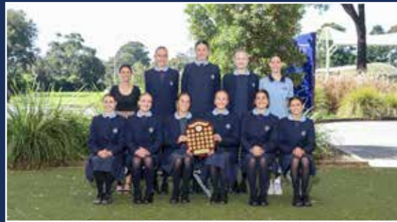
INTERMEDIATE NETBALL: CONFERENCE 3 & SCS CHAMPIONS