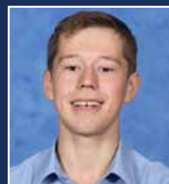
William Elmer Triathlon