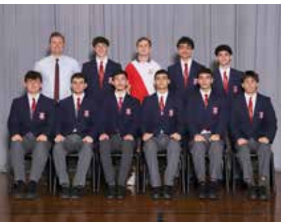
Senior OzTag Conference 3 Champions