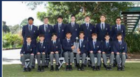
ALL ABILITIES EUROPEAN HANDBALL: CONFERENCE 3 CHAMPIONS