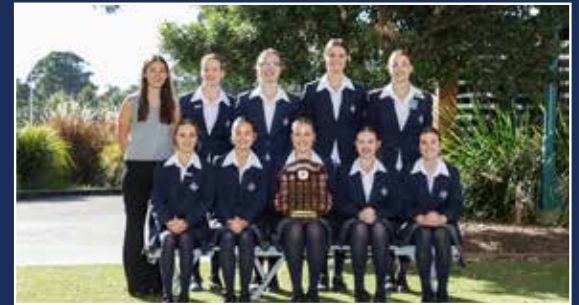
SENIOR NETBALL: CONFERENCE 3 CHAMPIONS AND SCS RUNNERS UP