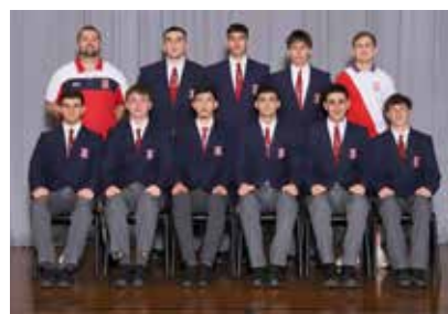
Senior Rugby 7s Conference 3 and Sydney Catholic Schools Champions