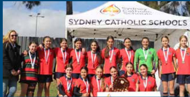
Junior Girls Football